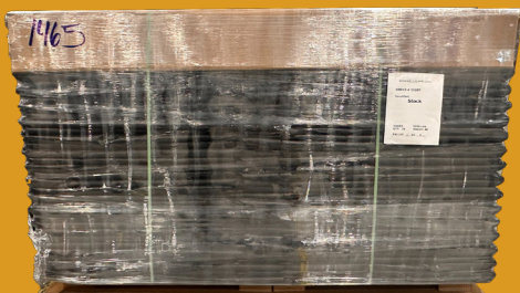
18-20 275 gallon LP Liquid Totes per Stack

LP Liquid Totes by Lapoint Packaging contribute in multiple ways to our customers' bottom-line savings