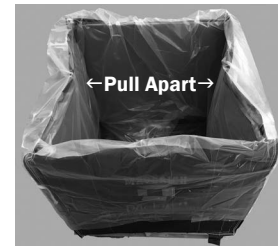
Product color and label may vary from illustrations