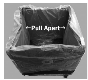
Product color and label may vary from illustrations